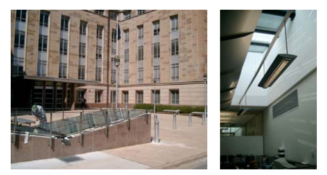
External and internal views of skylight penetrations.