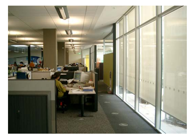
Suspended luminaires, and external screens on courtyard windows.