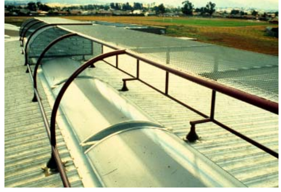
External view of skylight with steel mesh shading.