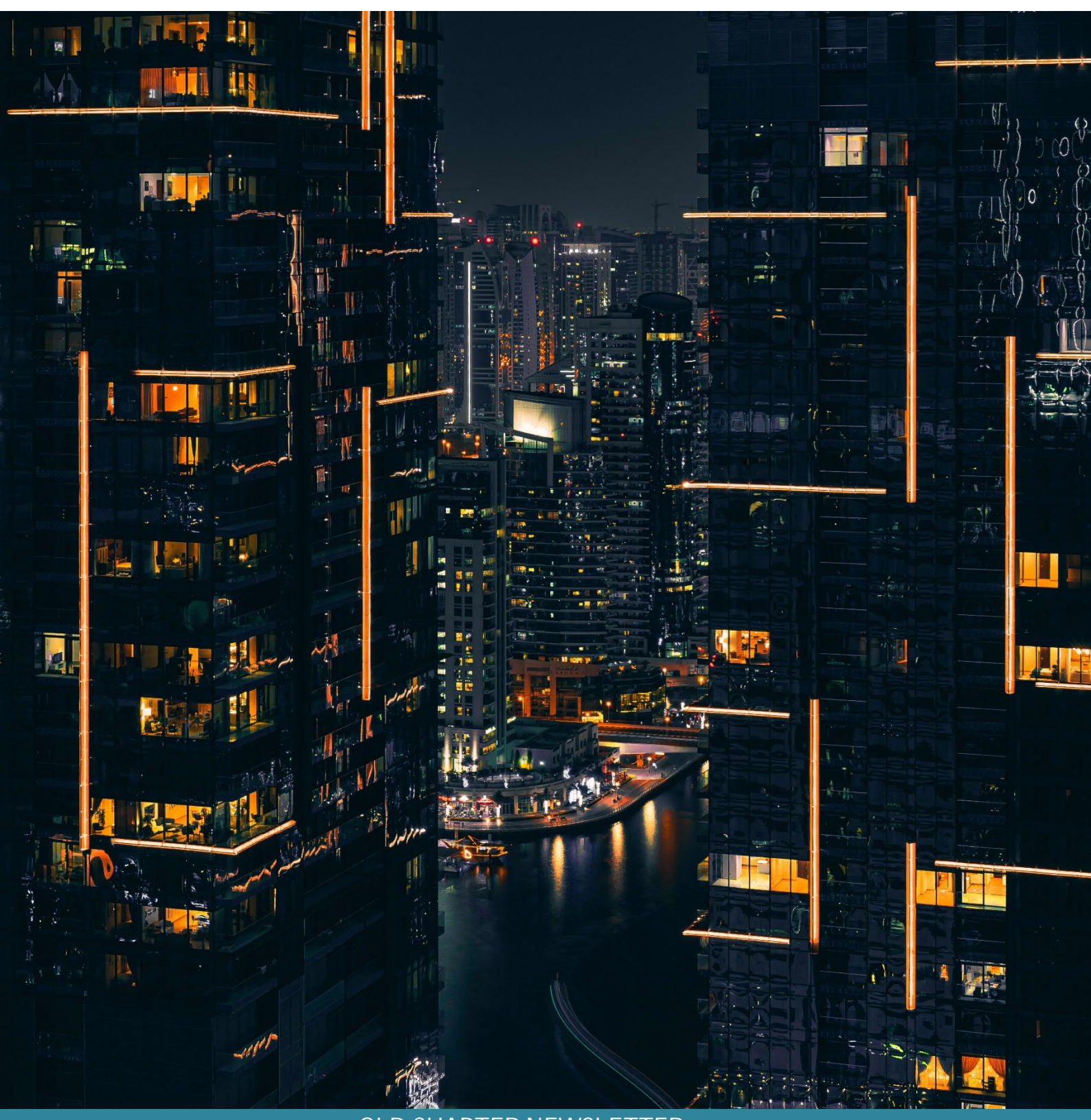
QLD CHAPTER NEWSLETTER