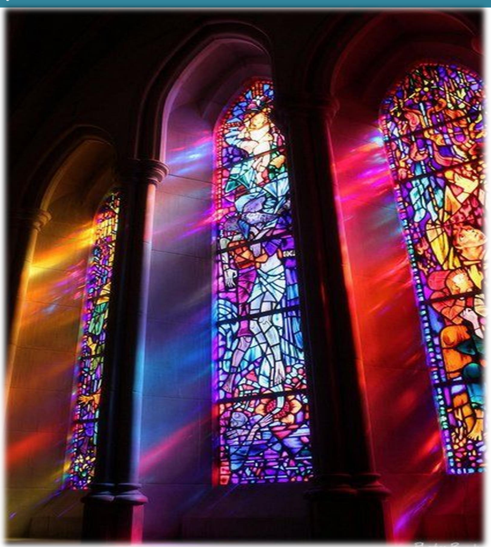
Light through colourful glass, Photo is courtesy of