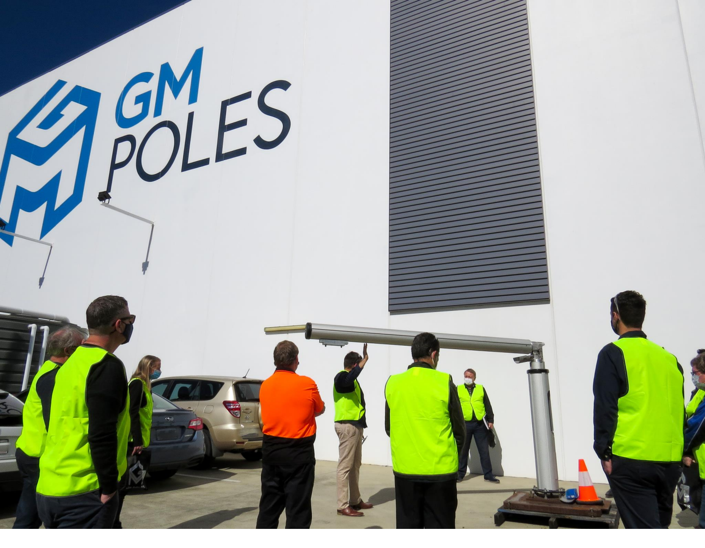
Group One viewing the flexibility and versatility of Aluminium poles