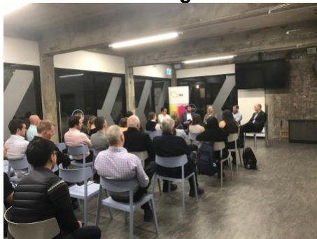
Q&A Design v's Engineering