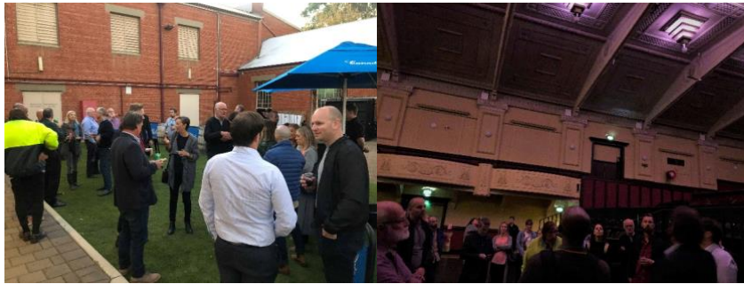
Thebarton Building Tour