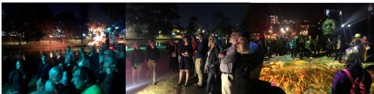
Yabarra – Gathering of Light