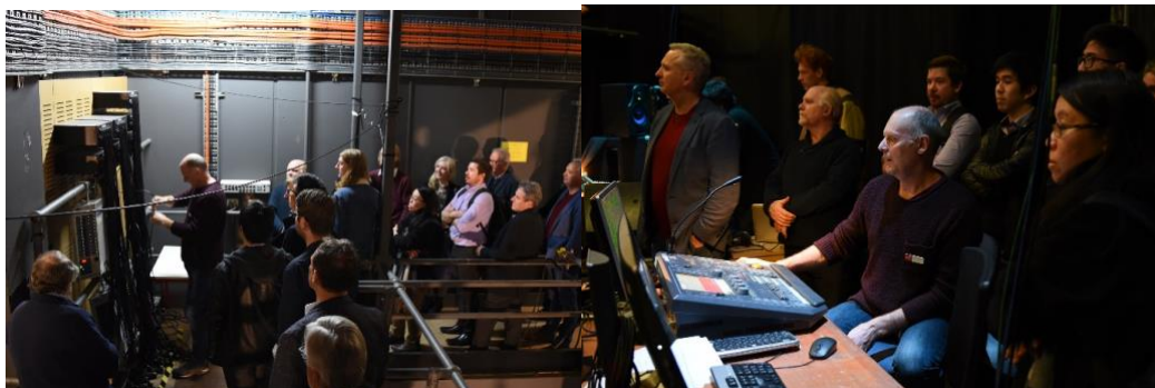
Adelaide Central Arts - Theatre Lighting