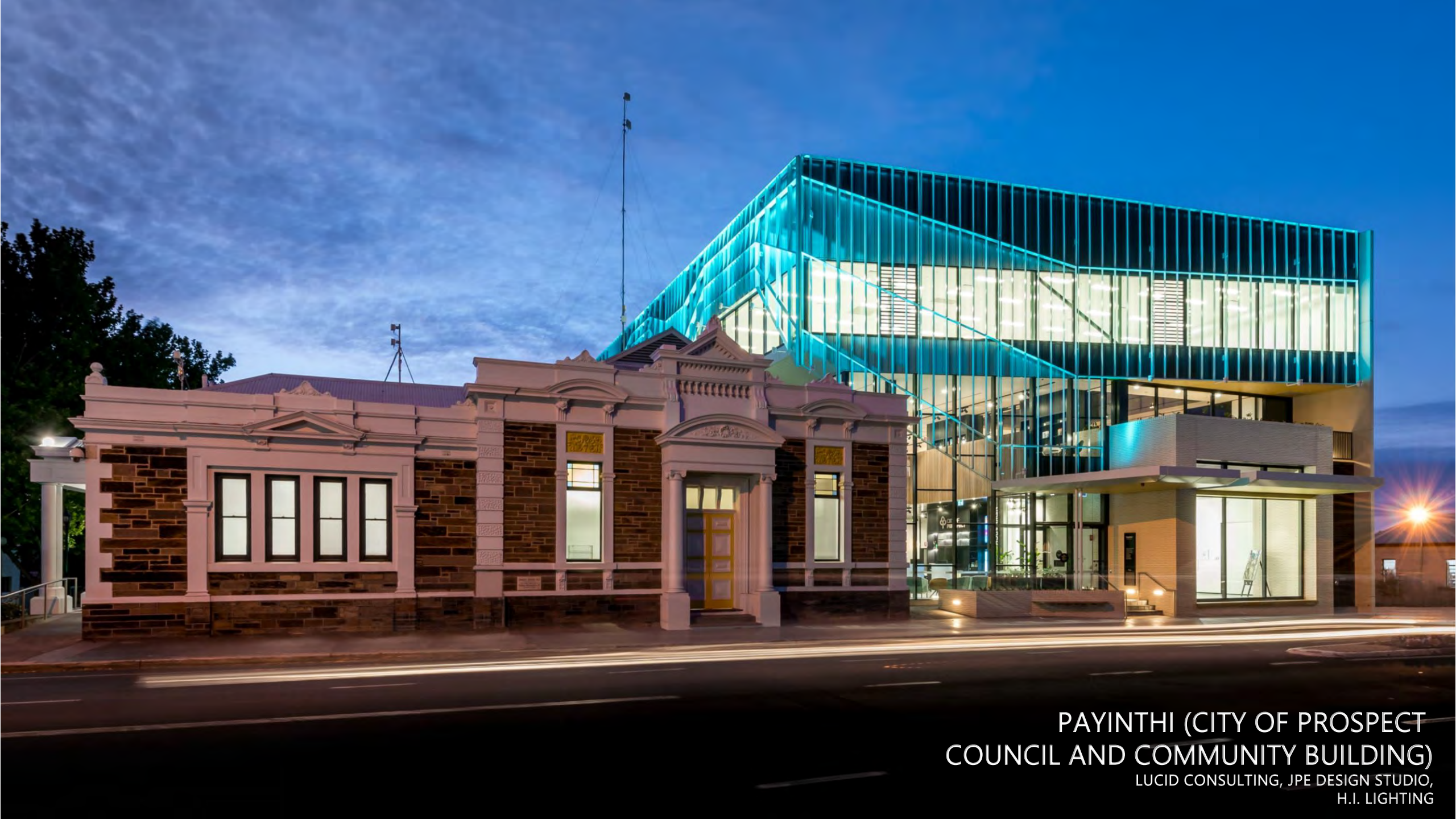
PAYINTHI (CITY OF PROSPECT COUNCIL AND COMMUNITY BUILDING) LUCID CONSULTING, JPE DESIGN STUDIO, H.I. LIGHTING