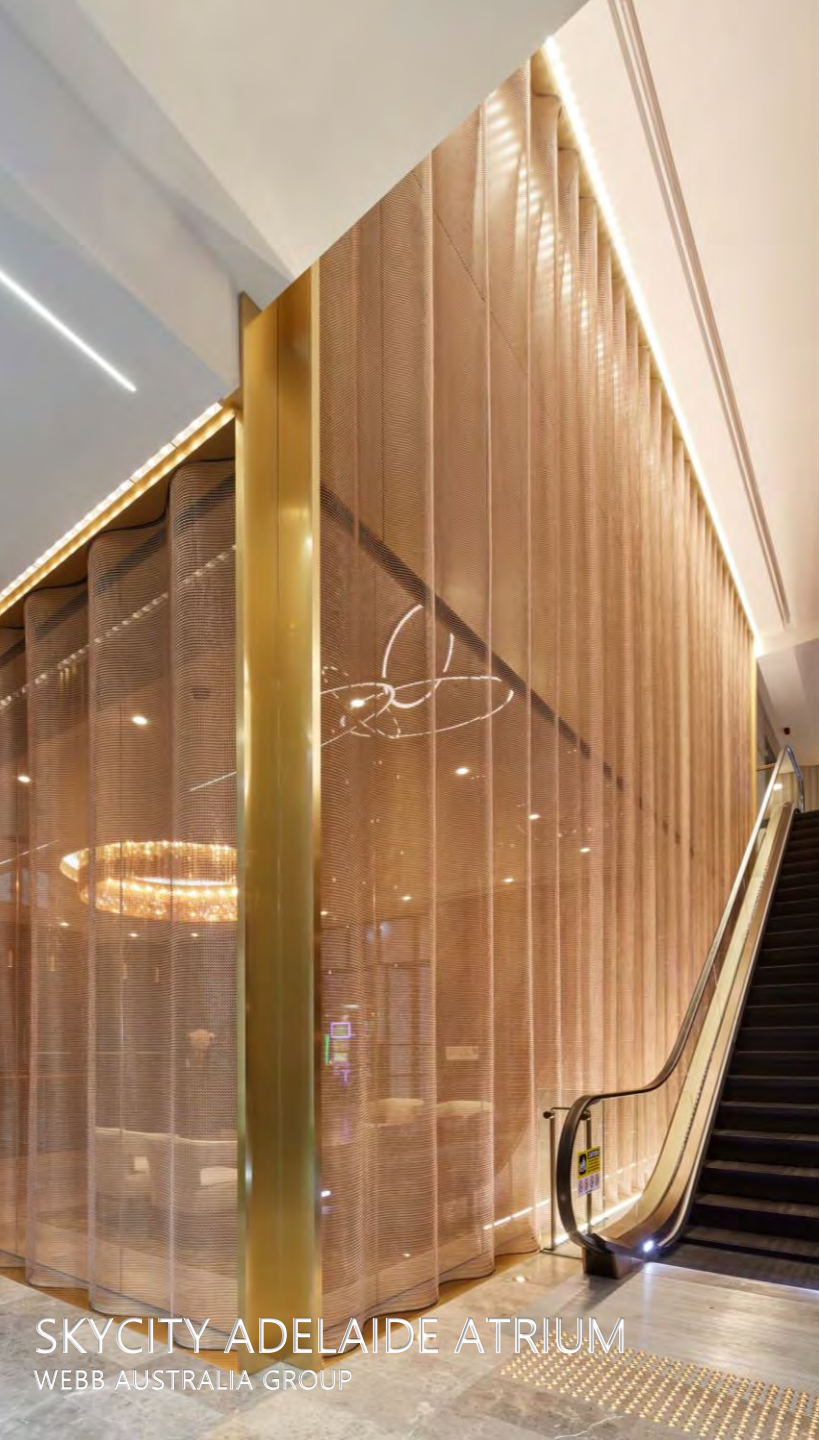
SKYCITY ADELAIDE ATRIUM WEBB AUSTRALIA GROUP