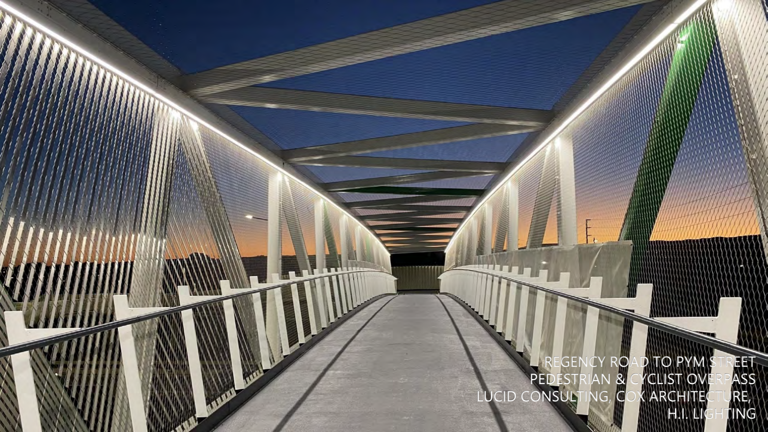
REGENCY ROAD TO PYM STREET PEDESTRIAN & CYCLIST OVERPASS LUCID CONSULTING, COX ARCHITECTURE, H.I. LIGHTING