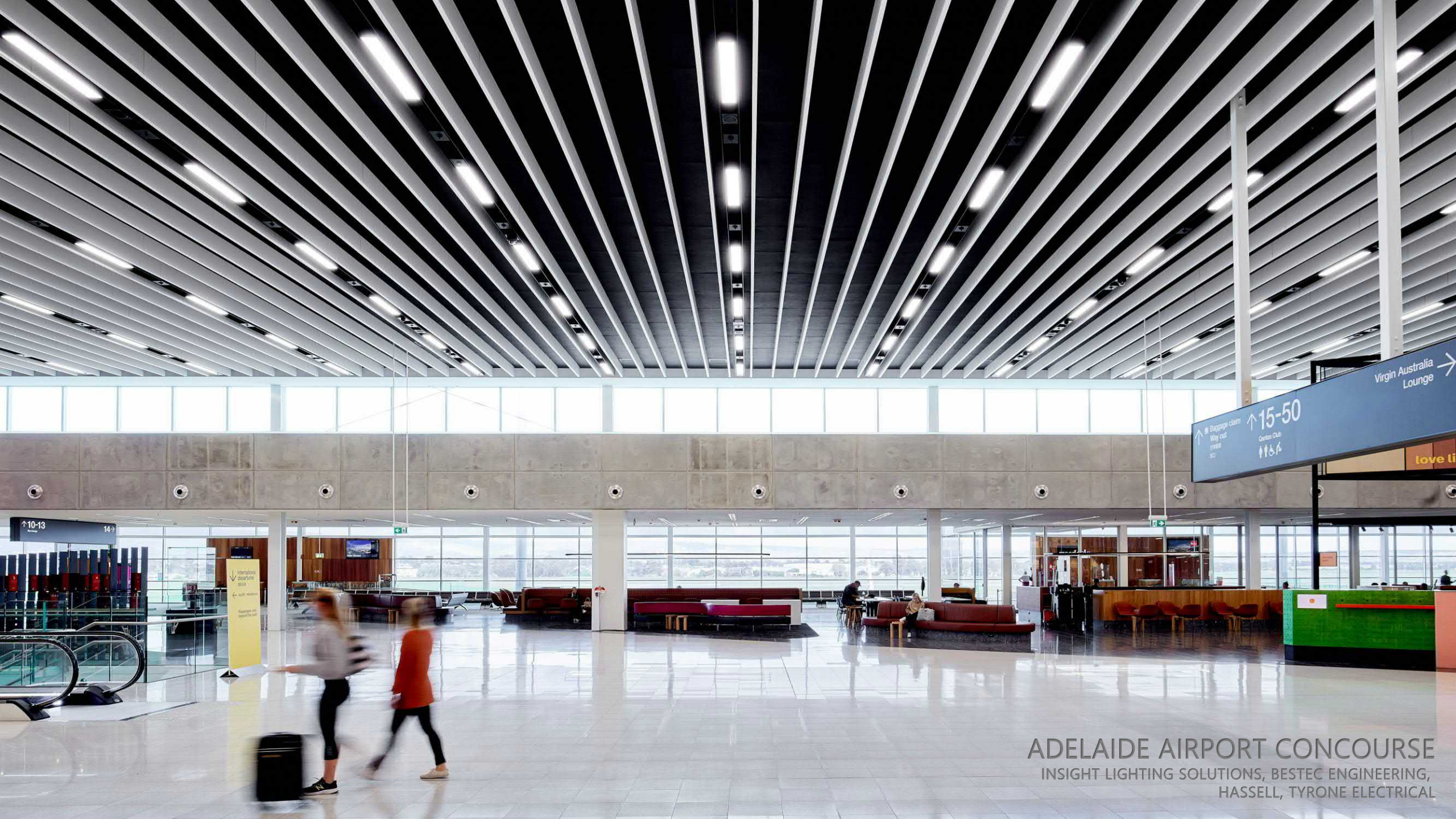
ADELAIDE AIRPORT CONCOURSE INSIGHT LIGHTING SOLUTIONS, BESTEC ENGINEERING, HASSELL, TYRONE ELECTRICAL