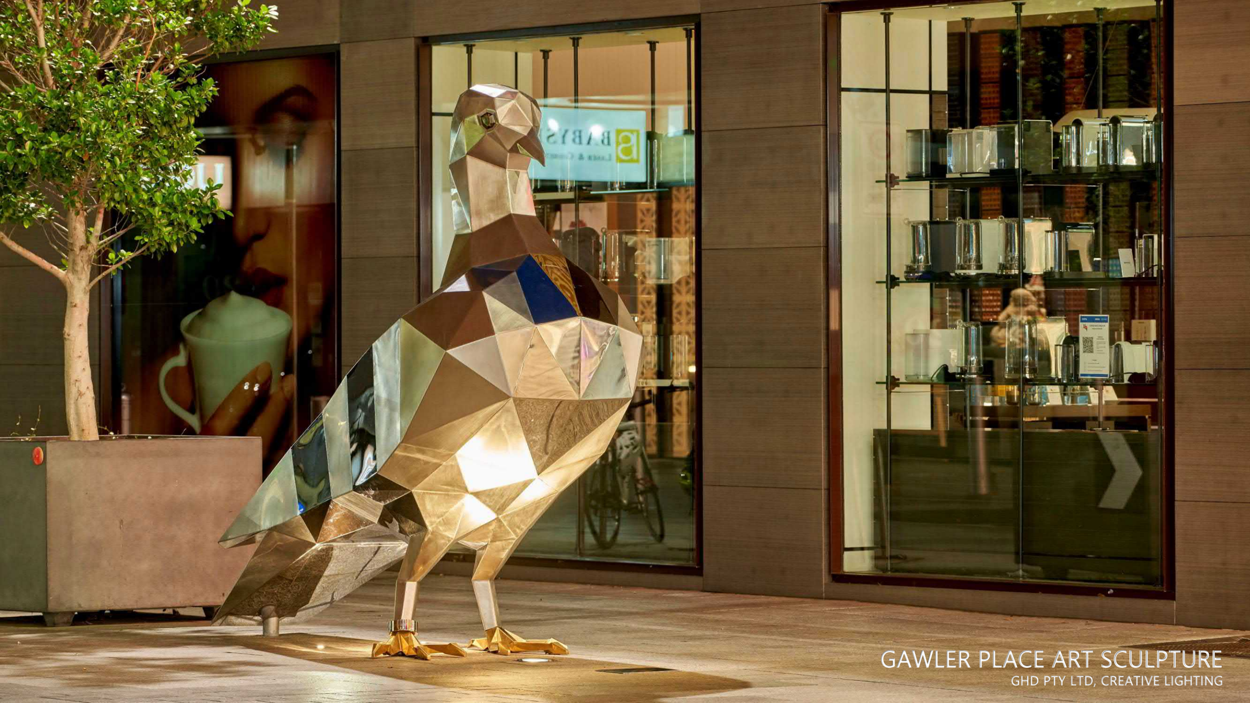
GAWLER PLACE ART SCULPTURE GHD PTY LTD, CREATIVE LIGHTING