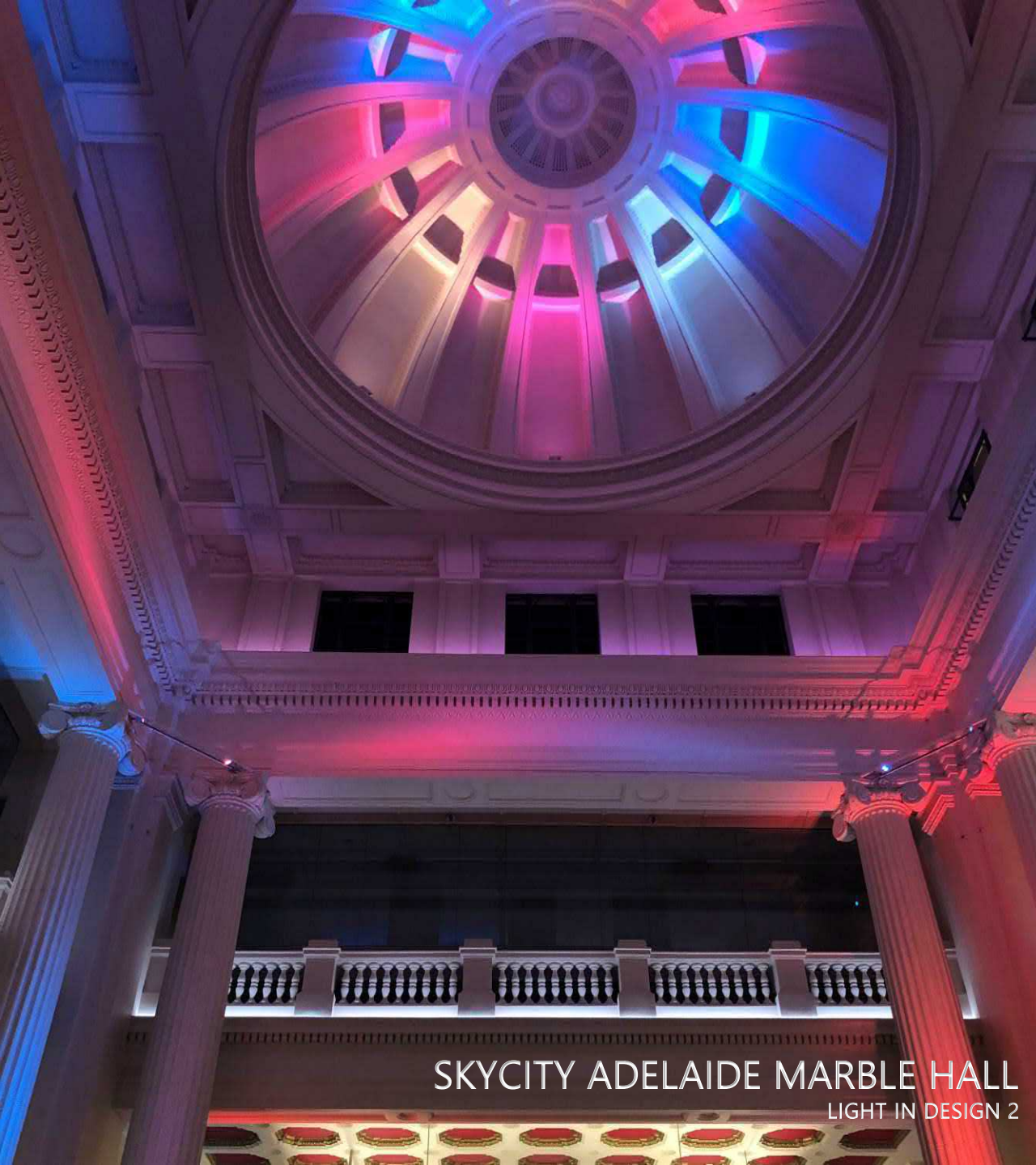
SKYCITY ADELAIDE MARBLE HALL LIGHT IN DESIGN 2