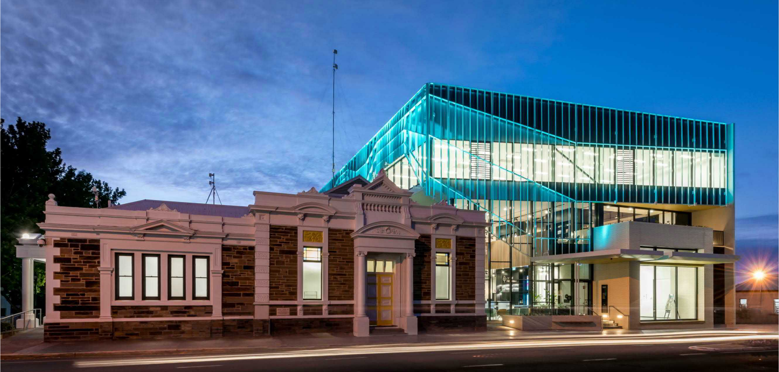
PAYINTHI (CITY OF PROSPECT COUNCIL AND COMMUNITY BUILDING) LUCID CONSULTING, JPE DESIGN STUDIO, H.I. LIGHTING