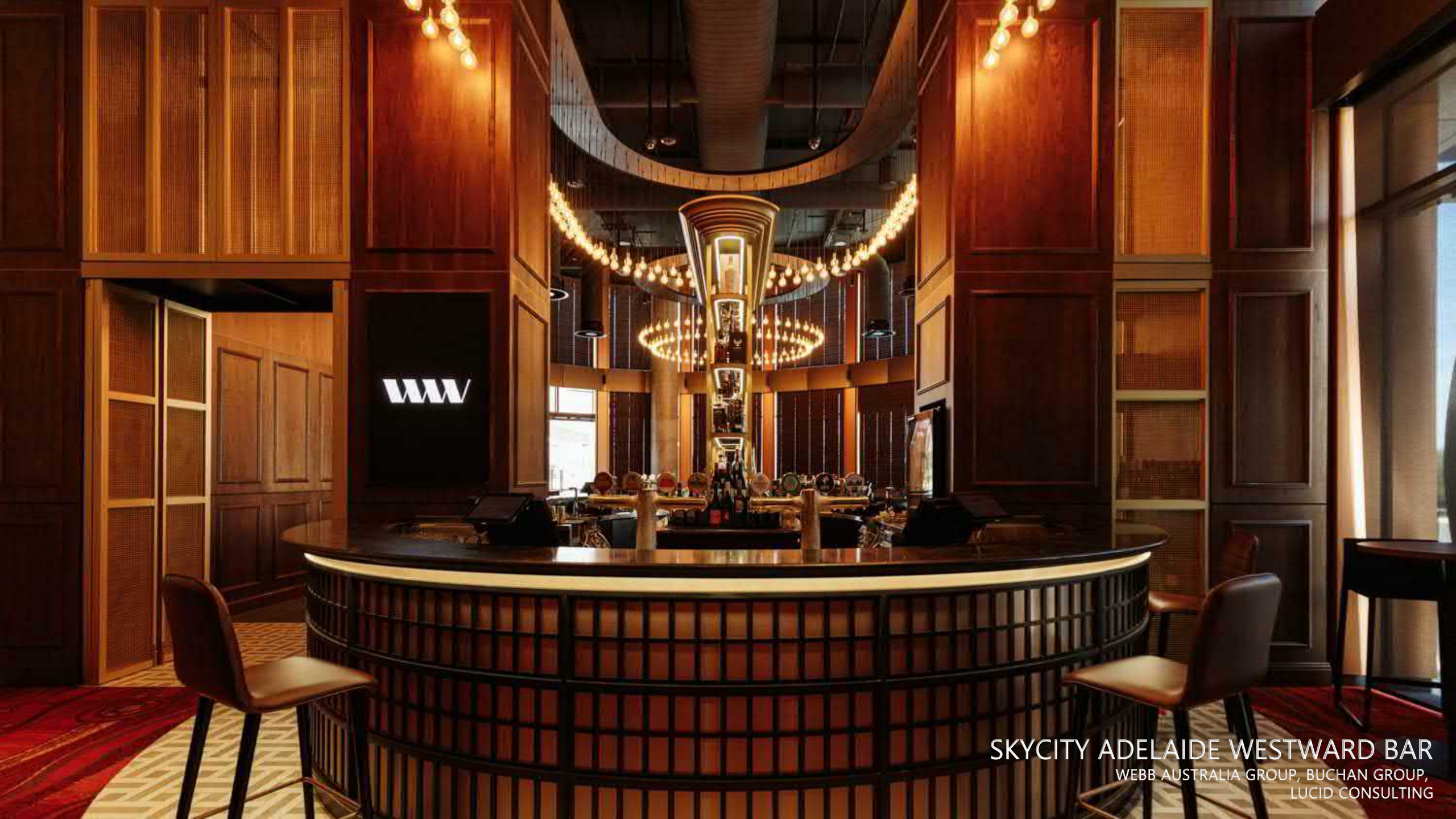
SKYCITY ADELAIDE WESTWARD BAR WEBB AUSTRALIA GROUP, BUCHAN GROUP, LUCID CONSULTING