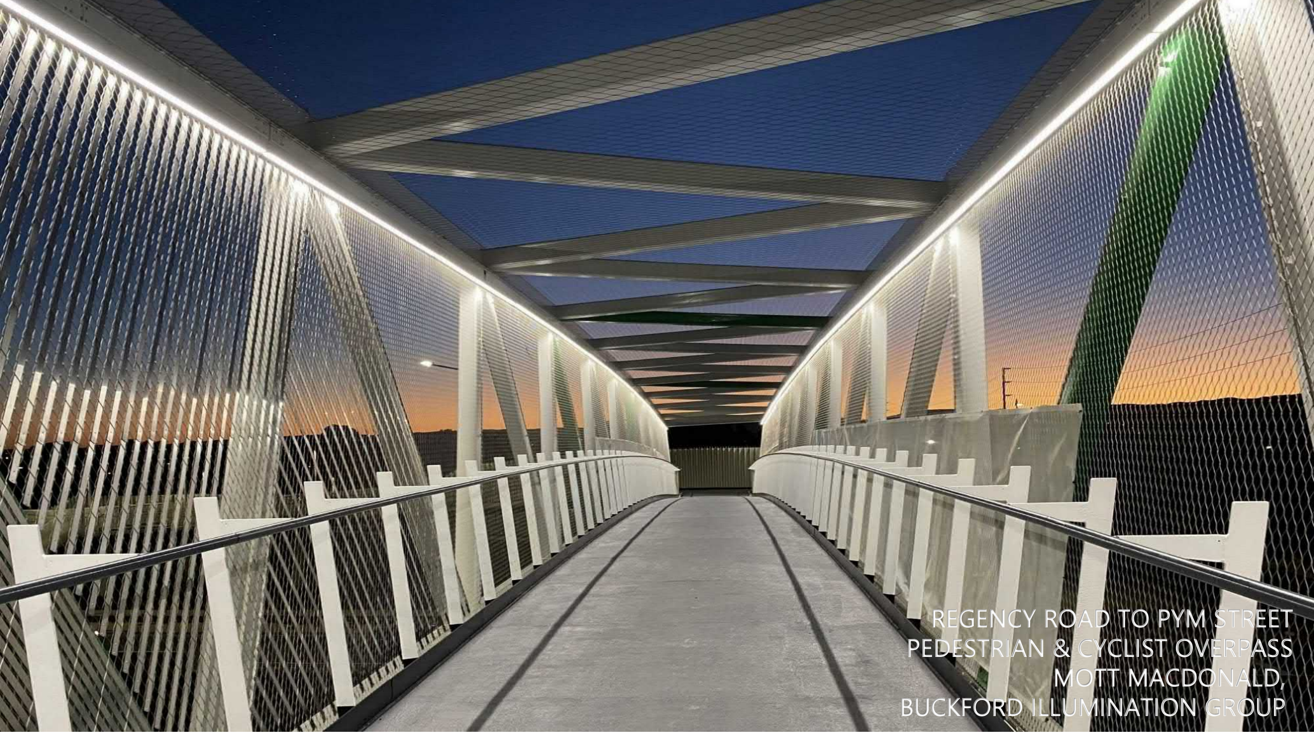
REGENCY ROAD TO PYM STREET PEDESTRIAN & CYCLIST OVERPASS MOTT MACDONALD, BUCKFORD ILLUMINATION GROUP