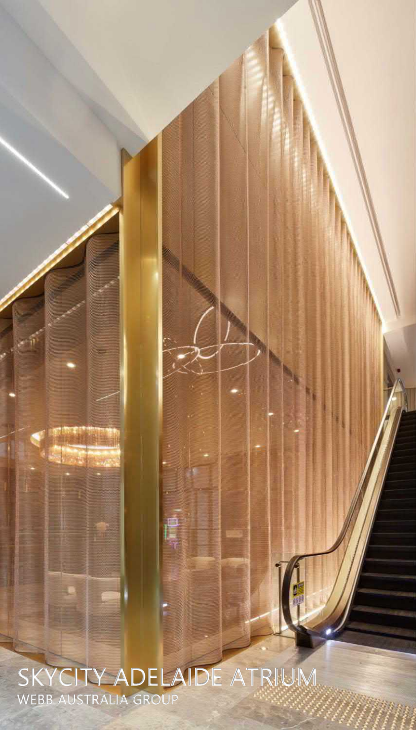
SKYCITY ADELAIDE ATRIUM WEBB AUSTRALIA GROUP