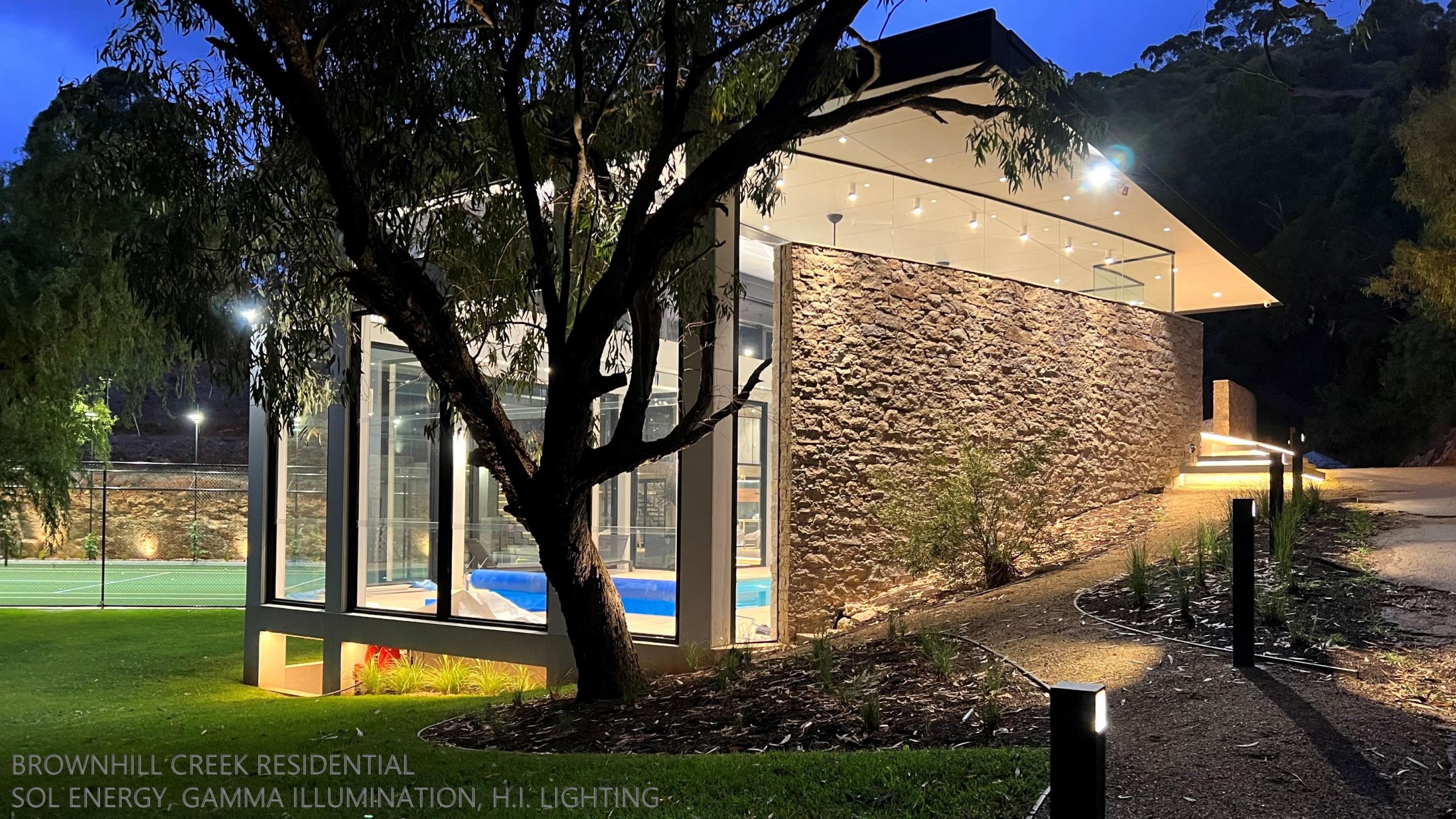
BROWNHILL CREEK RESIDENTIAL SOL ENERGY, GAMMA ILLUMINATION, H.I. LIGHTING