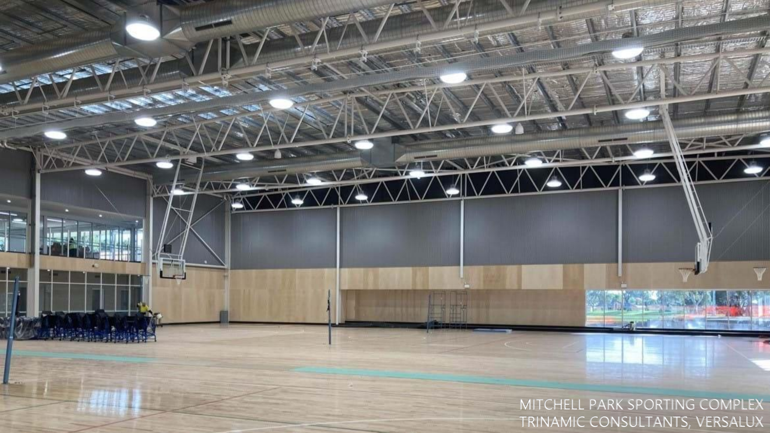
MITCHELL PARK SPORTING COMPLEX TRINAMIC CONSULTANTS, VERSALUX