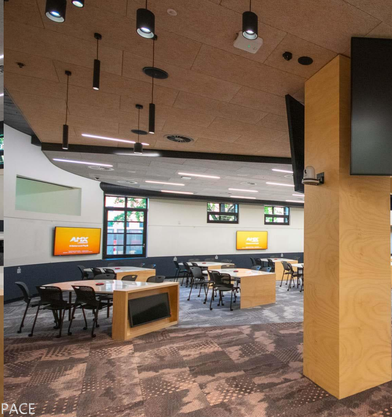
UNIVERSITY OF ADELAIDE HONE & STIRLING TEACHING SPACE WSP, ARM ARCHITECTURE, SA LIGHTING, FOS LIGHTING