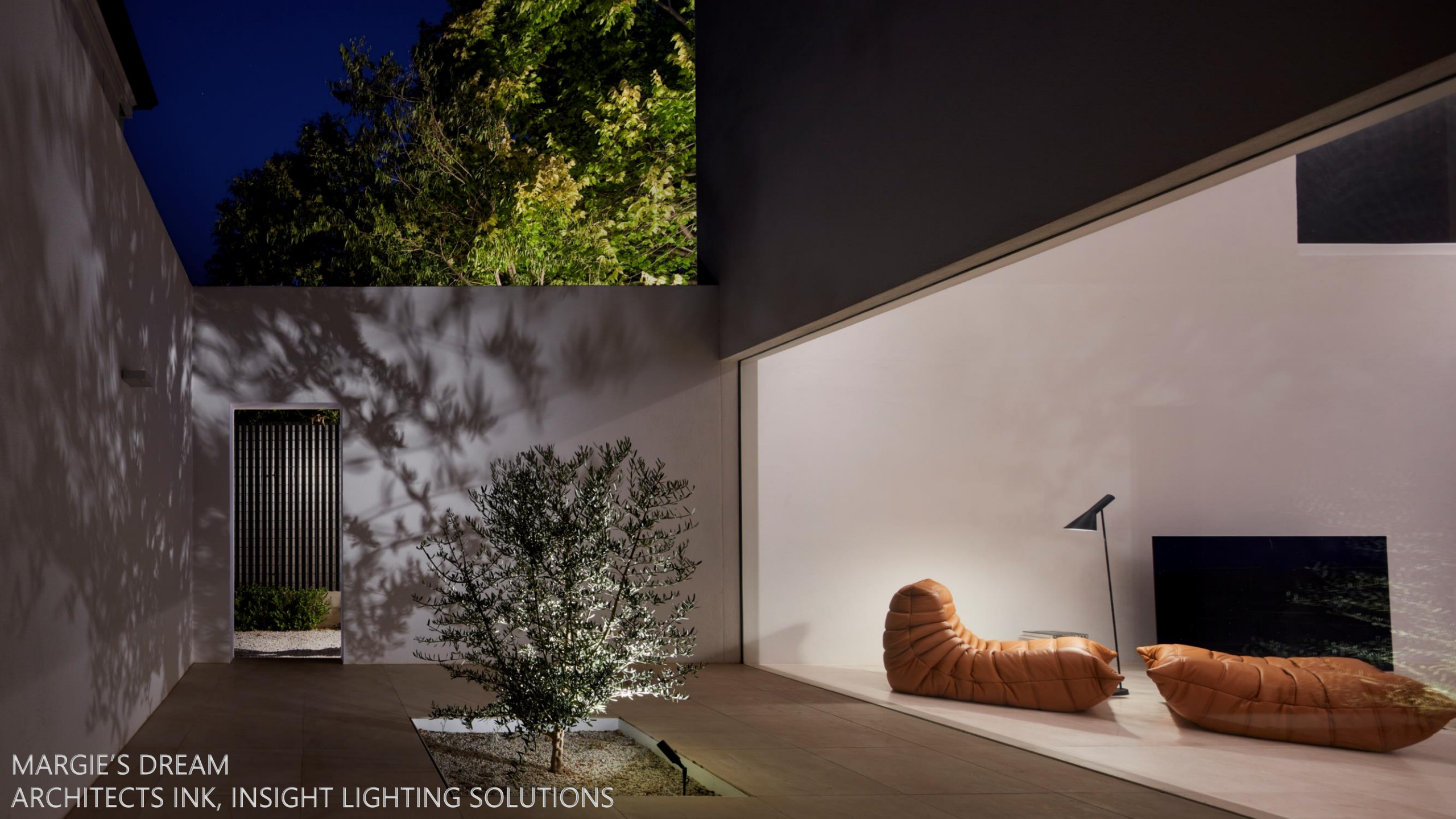
MARGIE'S DREAM ARCHITECTS INK, INSIGHT LIGHTING SOLUTIONS