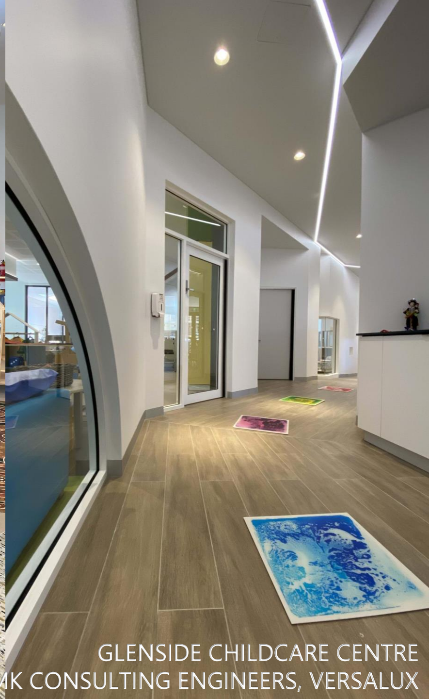
GLENSIDE CHILDCARE CENTRE TMK CONSULTING ENGINEERS, VERSALUX