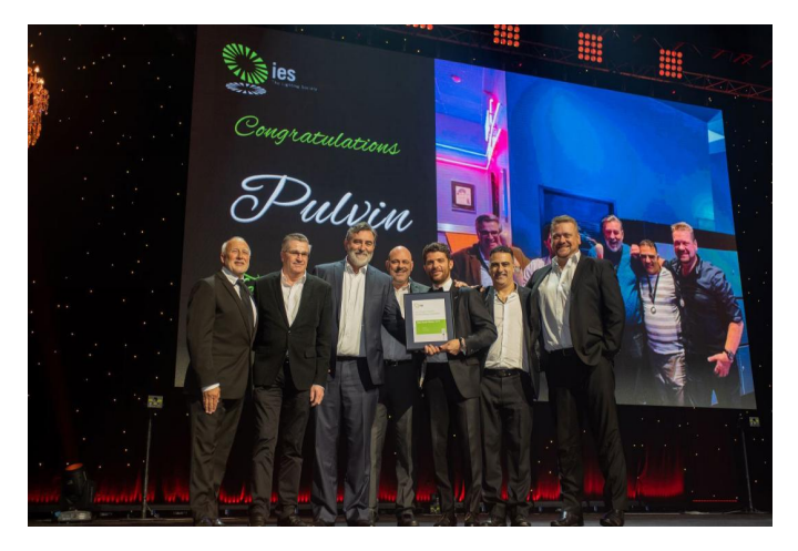
Ten Pin Bowling Champions Pulvin