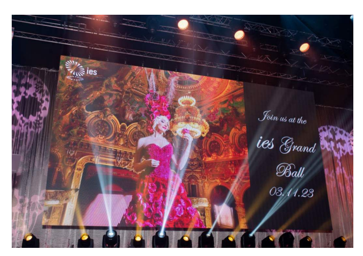
See you next Friday!