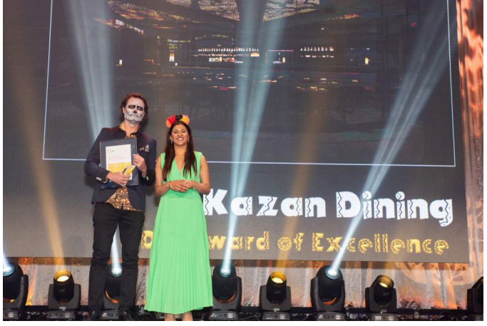
Lighting Design Award of Excellence Kazan Dining, Electrolight