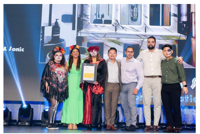
Lighting Design Award of Commendation EOT 99 Mount Street, Cundal4Light