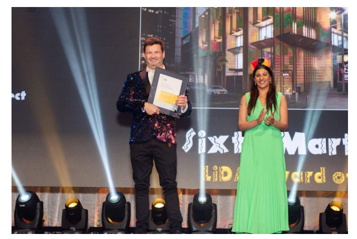
Lighting Design Award of Excellence Sixty Martin Place, Arup