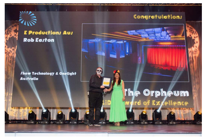
Lighting Design Award of Excellence The Orpheum, E Productions Aus