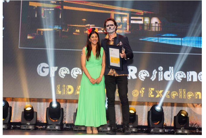
Lighting Design Award of Excellence Greenhills Residence, Electrolight