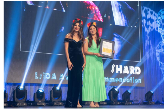
Light Sculpture & Installation Award of Commendation Shard - Lumos Creatives