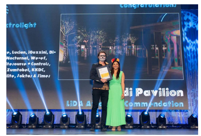
Lighting Design Award of Commendation Bondi Pavillion, Electroligh