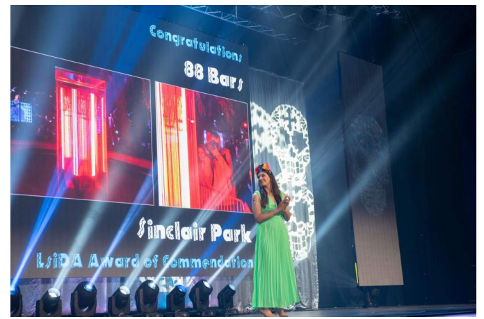
Light Sculpture & Installation Award of Commendation 88 Bars, Sinclair Park