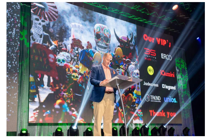
VIP Ultra sponsors.