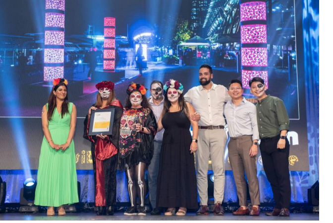
Light Sculpture & Installation Award of Excellence Twenty-Seven, Cundal4Light