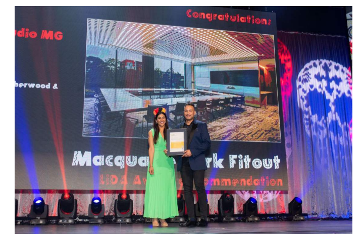
Lighting Design Award of Commendation Macquarie Park fitout, Light Studio MG

Title: HALO Company: Illumaphonium Ltd (Commendation)