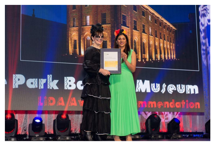
Lighting Design Award of Commendation Hyde Park Barrack Museum, Electrolight