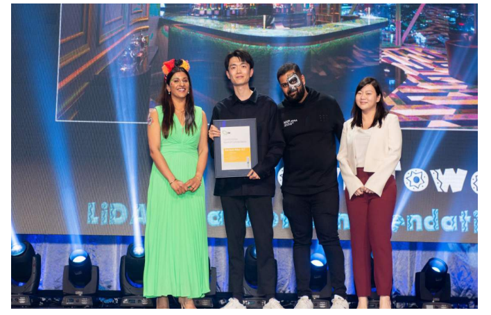
Lighting Design Award of Commendation Crown Tower, FPOV